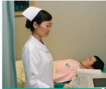
Electrocardiography | 心電圖檢查