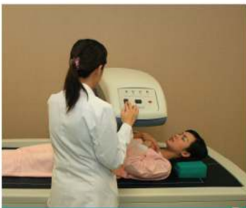
Bone DEXA Scan | 骨密檢查