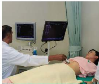
Ultrasound Examination | 超音波檢測