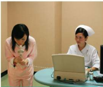
Lung Function Tests | 肺功能檢查