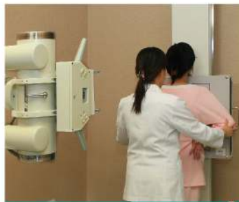
Chest X-Ray | X光胸部