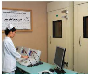
Audiometry Tests | 聽力檢查