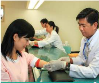
Blood Sampling | 抽血