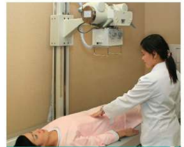
Abdominal X-Ray | X光腹部