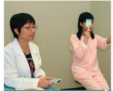
Vision Tests | 視力檢查