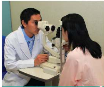
Slit Lamp Examination | 裂隙燈