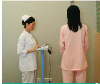
Anthropometric Measurement & Vital Signs | 一般檢查