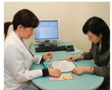
Health Management Counselling | 健康管理