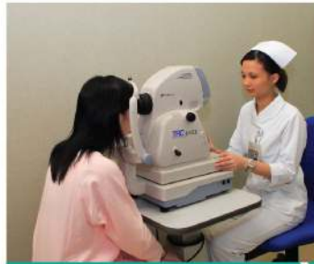
Retinography | 眼底攝影