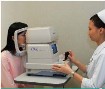
Ocular Tension Test | 眼壓檢查